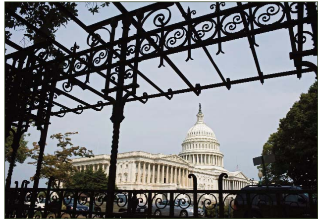
View of the Capitol's east façade from the Olmsted-designed viewing shelter at the southeast corner of the grounds.

The carriage-court will be bounded opposite the building by a walk or esplanade, laid with colored tile, and this will be separated from the broad turf spaces beyond it by a structure combining the purposes of a parapet or barrier, and a seat, so curved in plan, that unobstructed views of the Capitol may be obtained from it at various distances from 100 to 300 feet from the nearest point of its front, and at every practicable angle of vision. The parapet is to be formed of blue and red stone, and is to