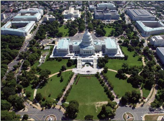
Olmsted's innovative design has remained largely intact.

ture, and left little but a sterile and exceedingly stiff brick clay, over which street-sweepings from the old dirt roads of Washington, with some Tiber mud, have from time to time been laid. A careful forester's survey made this Summer indicated that the trees must have been generally taken from the woods, poorly lifted and poorly planted, and that their roots had rarely attempted to penetrate the clay but had sought food by running far and wide close to the surface. Three-fourths of them were in unsound condition, many far gone with decay, and the foliage of nearly all began to wilt after lacking rain but two weeks. With two exceptions the largest and best stood near the east boundary, their roots breaking out on a bank eight feet in height formed by the recent grading down of First-st., which bank barred both approach and vision toward the Capitol. Shrubs and flower beds were dropped about here and there, many of the shrubs being of late sick or dead, and the flower beds overgrown by grass and weeds.